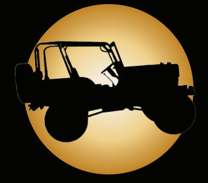
Jeep Tour Vouchers: $35,00