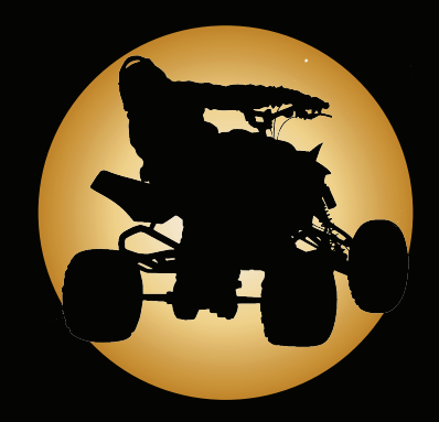
ATV Vouchers: $60.00