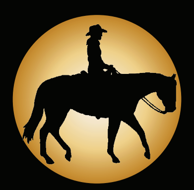
Horseback Vouchers: $75.00

8:30 am - 10:00 am 11:00 am - 12:30 pm 1:30 pm - 3:00 pm 4:00 pm - 5:30 pm