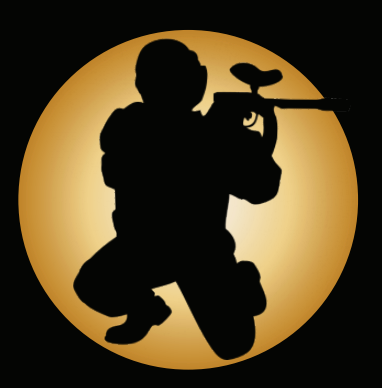
Paintball Vouchers: $25.00