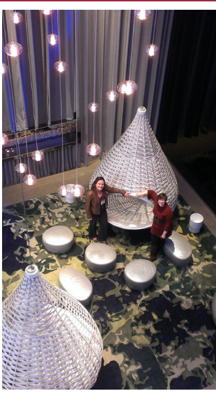
December 19th - 5-7pm - Holiday Happy Hour Borough Restaurant -Parlour Room, Minneapolis, MN