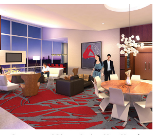
Potawatomi Bingo Casino New Hotel Milwaukee, Wisconsin Opening Summer 2014!

CUNINGHAM GROUP ARCHITECTURE, INC. www.cuningham.com