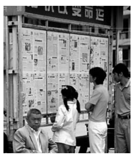
Long before the internet, people would gather in a public square and read the world news.