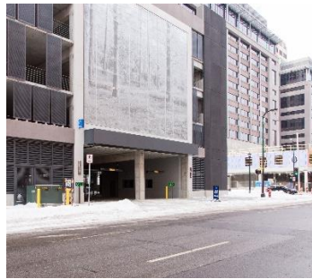
701 S 3 rd Street