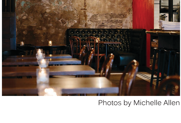
A suburban gem, Eagan's Volstead House is located behind Bottles and Burgers.