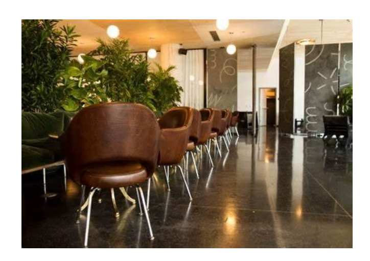
Follow Moore & Giles on Instagram and find them at Mooreandgiles.com