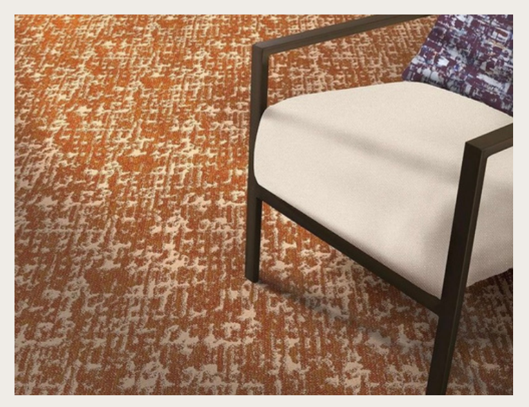
Carpet - Stacy Garcia Blue Label for Tarkett: Blend. Color: 118