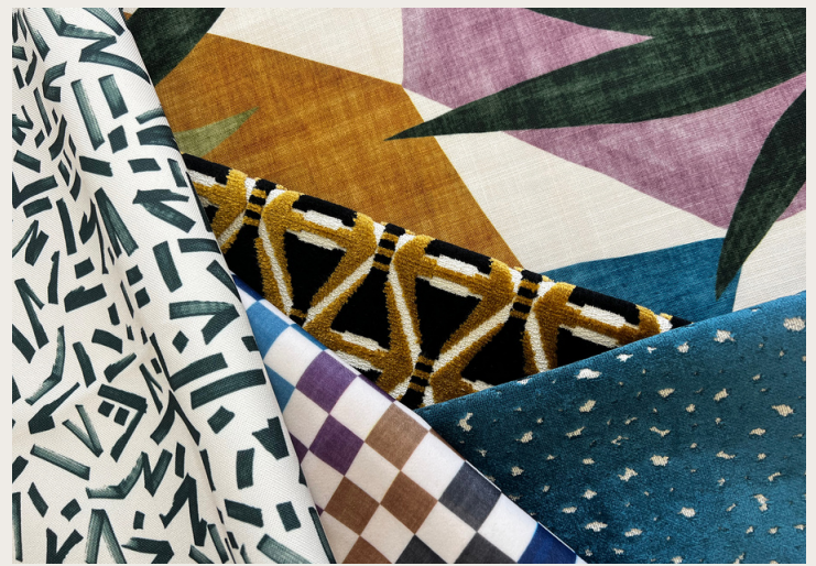
Upholstery, Drapery, Bedding Fabrics - Stacy Garcia Blue Label for LebaTex: Impressions Collection

"It will continue to derive from my deep passion for my craft and a desire to make a positive impact through my work. I am constantly inspired by the colors and textures all around me, and at the same time, I am also motivated by the satisfaction of seeing my designs come to life and bring forth style into any space. Whether it's a wall covering that transforms a room or a carpeting that bring comfort, I find great fulfillment in knowing that my work allows art to become functional."