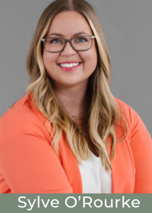
Senior Interior Designer at Kimberly Timmons Interiors