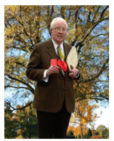
2008 Roger Milliken